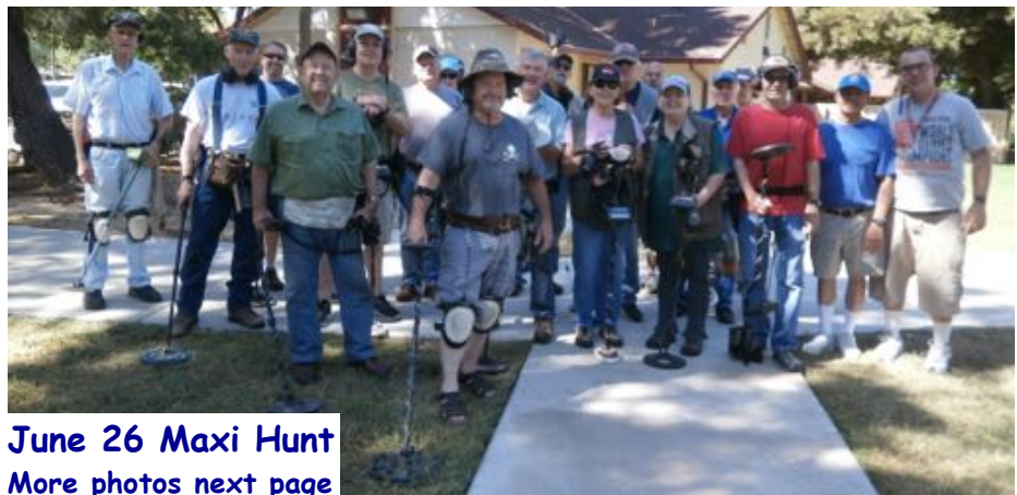
June 26 Maxi Hunt More photos next page